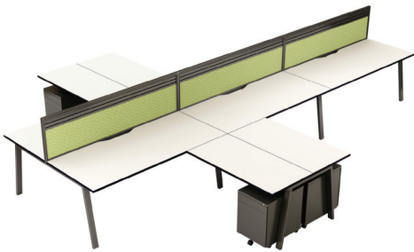
Linear Workstation system with returns