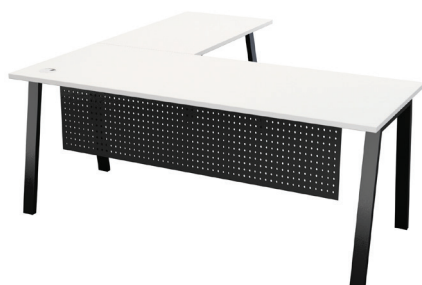
Desk and Return with optional modesty panel