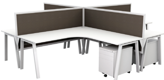
Corner Workstation Cluster