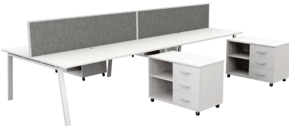
Shared Span Linear System