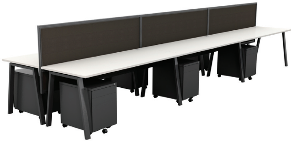
Linear Workstation System