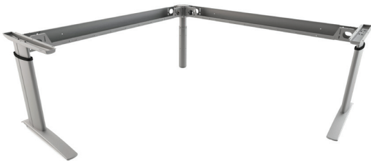
Element Tech Height Frame - Corner Workstation