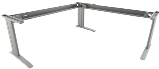
Element Fixed Height Frame - Desk and Return