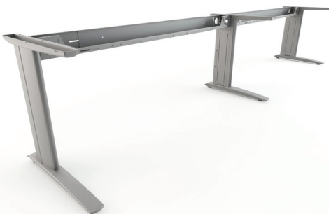
Linear bench system using Element Fixed Height End and Central legs with Telescopic beams